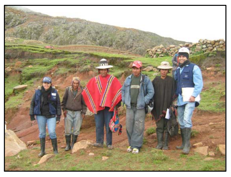
Kalachaca community members with Fundación Medmin representatives taking samples from Malku Khota and Wara Wara, February 2009

34. In June 2008, the Company retained Cumbre del Sajama, a Bolivian firm specializing in consulting services to the mining industry.<sup>53</sup> Cumbre del Sajama was specifically retained to support the Company's community relations efforts. Part of this support entailed conducting workshops ( talleres ) in different communities. The purpose of these workshops was to reinforce community relations and to educate the communities on the social, mining, and environmental aspects of mining and the Malku Khota Project.<sup>54</sup>