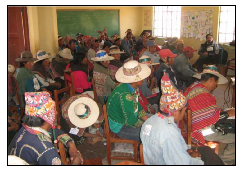
Workshop "Conociendo la Minería" at Ayllu Tacahuani